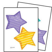
Stars 2 per page