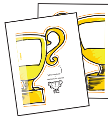
Trophy 2 Pages